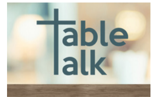
Table Talk will start at noon with a bring and share lunch (or bring your own if on a special diet), followed by a discussion on a topical subject and is open to everyone from any church community or none.

Friday, 15 th May at 12pm in the John Pearson Hall