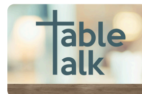
Table Talk will start at noon with a bring and share lunch (or bring your own if on a special diet), followed by a discussion on a topical subject and is open to everyone from any church community or none.

Friday, 17 th July at 12pm in the John Pearson Hall